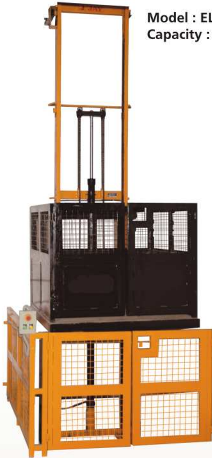
Model : ELP-10 Capacity : 1000 Kgs.