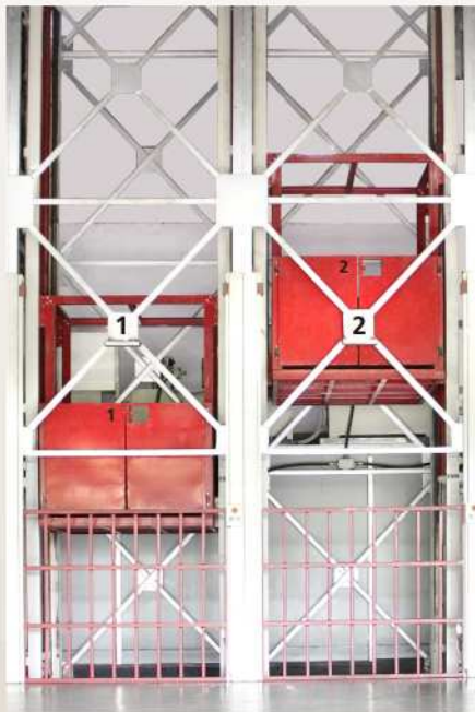
Model : ELP-10 D / ELP-20 D Capacity : 1000 / 2000 Kgs.

'Jay' Electric Lifting Platform are for exclusive goods handling only. No persons are allowed to travel the lift cage/platform. The electric lifting platform is very useful to transfer goods from one floor to another floor and the platform can be flushed with floor level when pit installed.